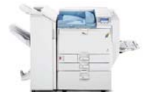
Aficio SP C811DN Color Printer