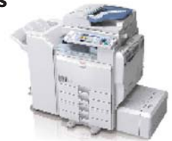
Aficio MP C4500 Color MFP