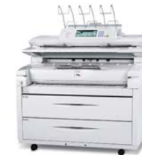
Aficio 480W Wide Format