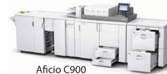
Aficio C900 High Volume Color